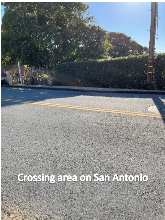
Crossing area on San Antonio