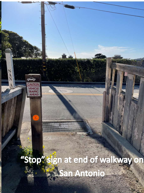
"Stop" sign at end of walkway on San Antonio