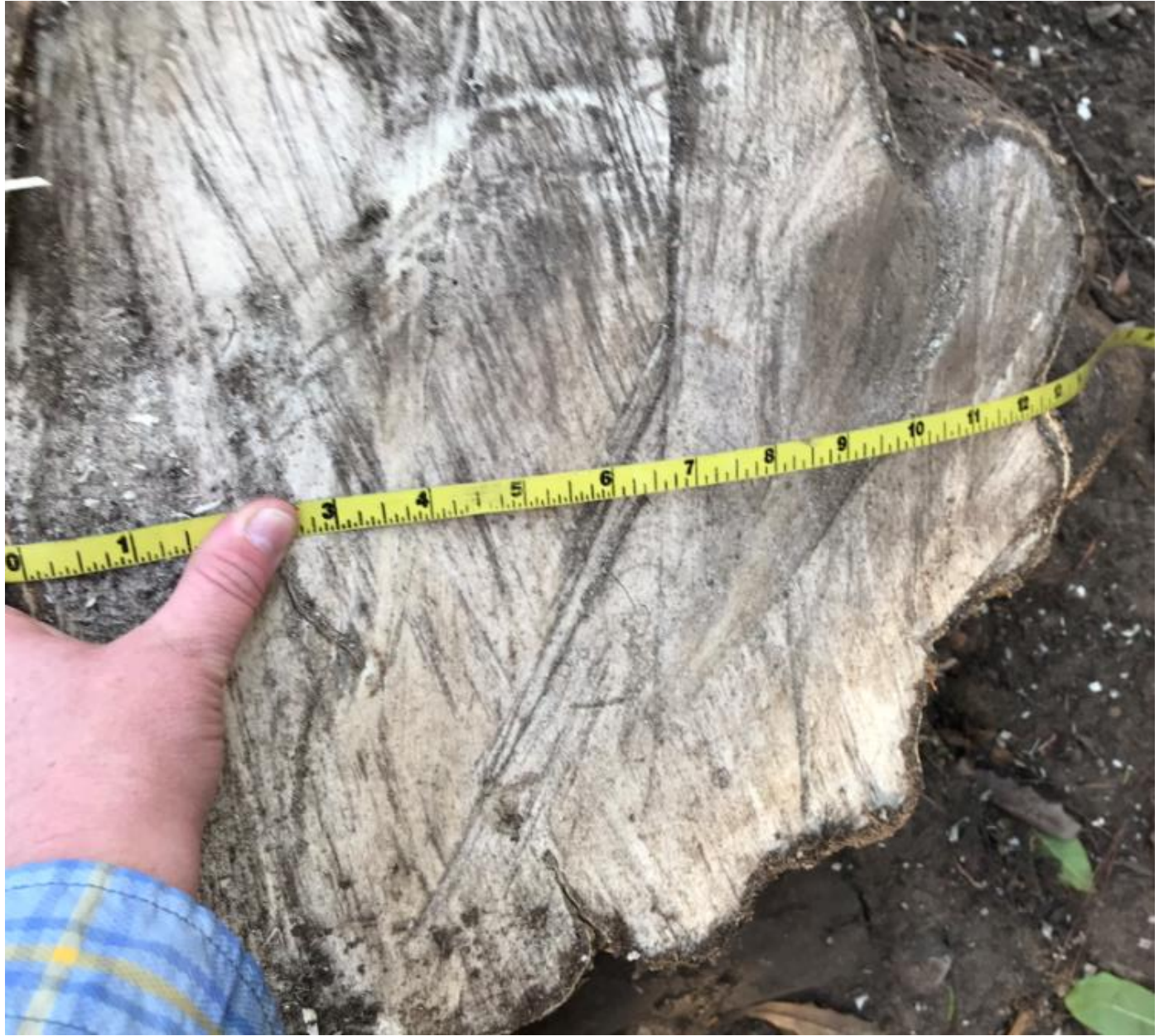
Figure 4 Trunk measurement