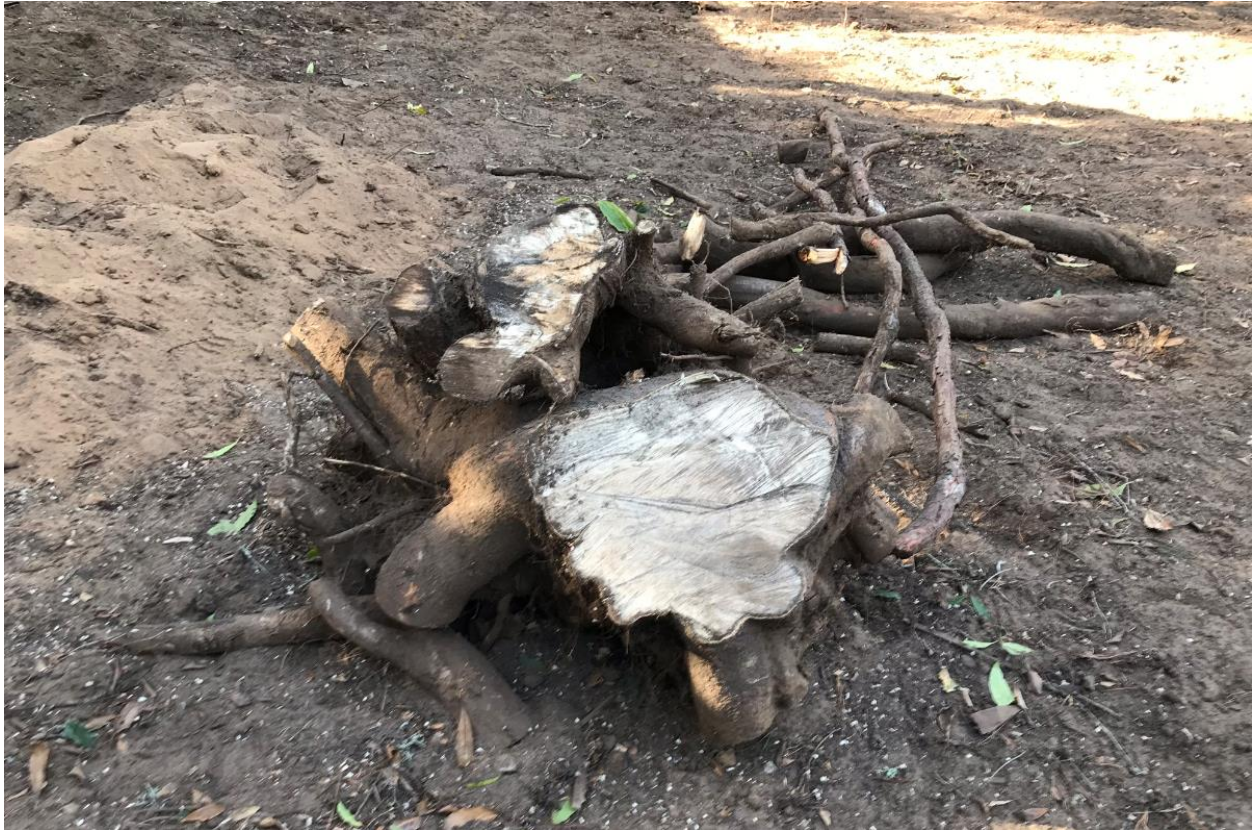
Figure 2 Trunk and root debris