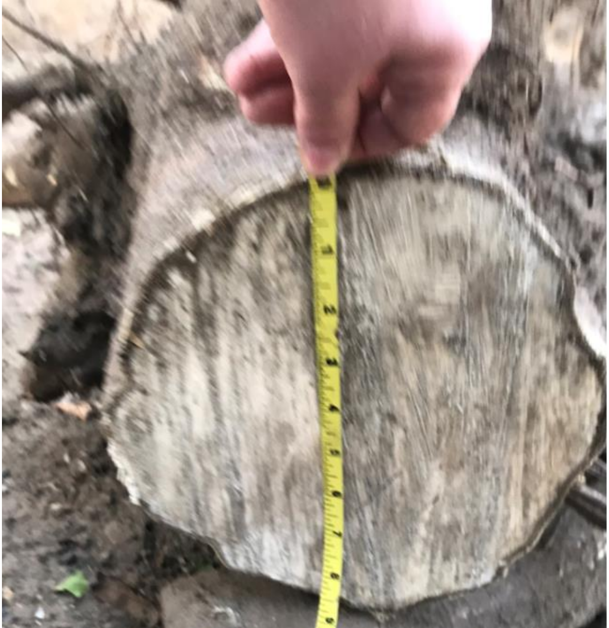
Figure 6 Trunk measurement