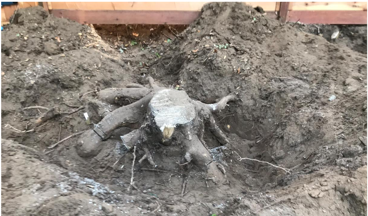
Figure 3 Stump excavation