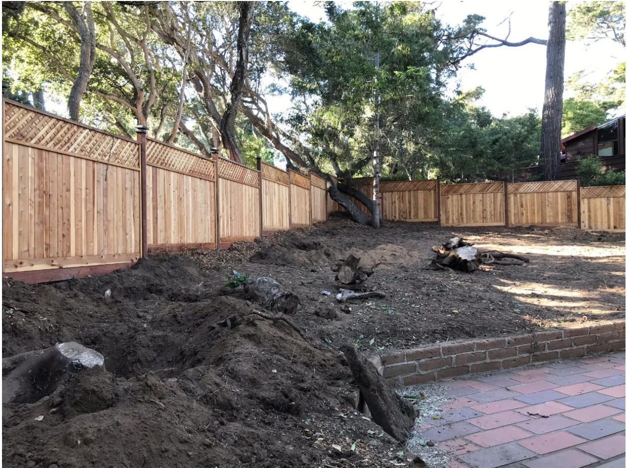
Figure 1 View of removed trees - stumps under hand ex