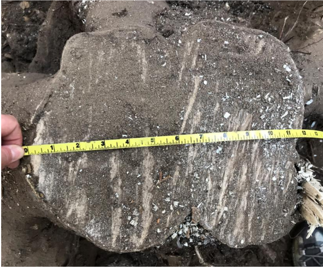
Figure 5 Trunk measurement