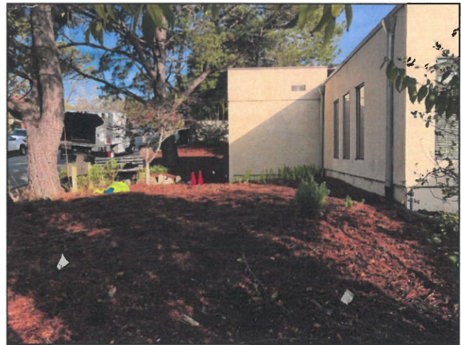
Project location viewed from the roof of the Public Works Department and from the south side of the proposed rain garden location, looking north.