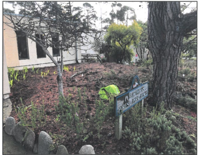
Project location viewed from sidewalk and Public Works Department walkway