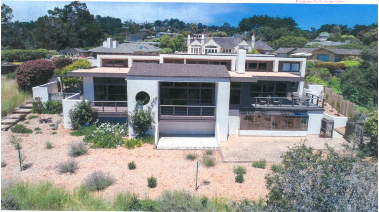
Rear (southwest) Elevation