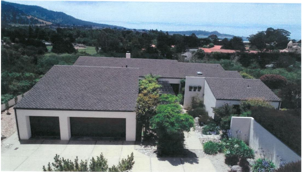
Front (northeast) Elevation of the Residence