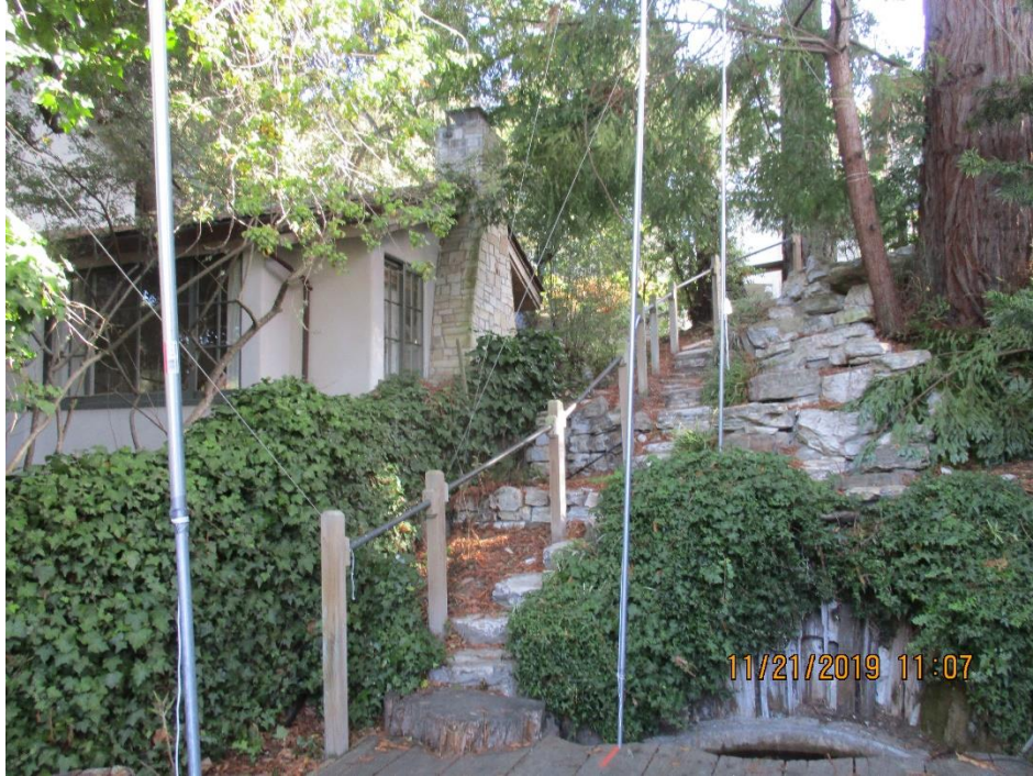
Staking and flagging poles in relation to the north neighbor's guest bedroom windows, located 3 feet from the property line