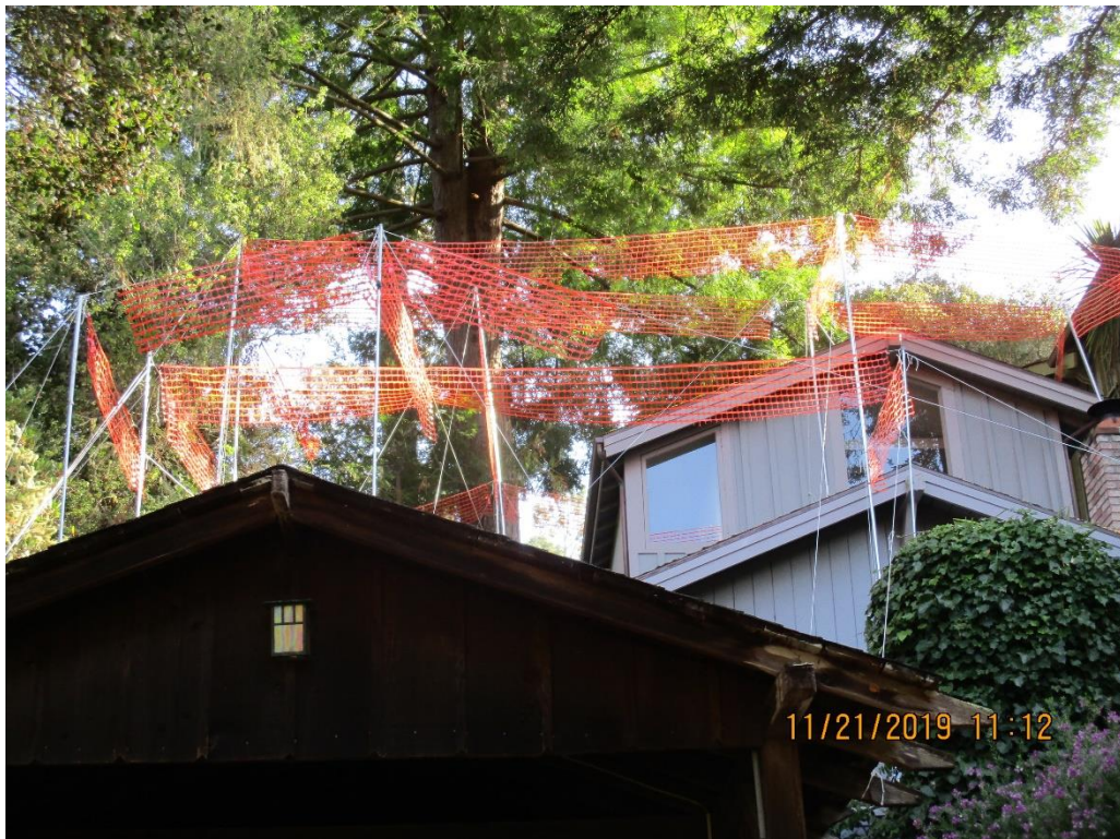
Close-up view of staking and flagging as viewed from 2 nd Avenue