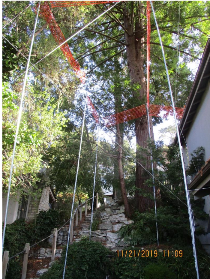
Second story addition to the north of the residence facing east