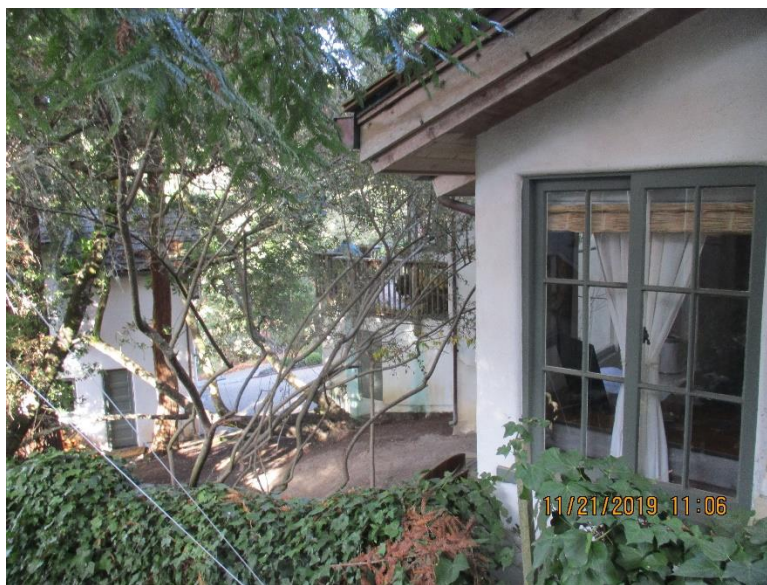
North neighbor's guest bedroom, (pictured far right), kitchen and deck located 26' back from the property line (middle) and garage with studio above (far left)