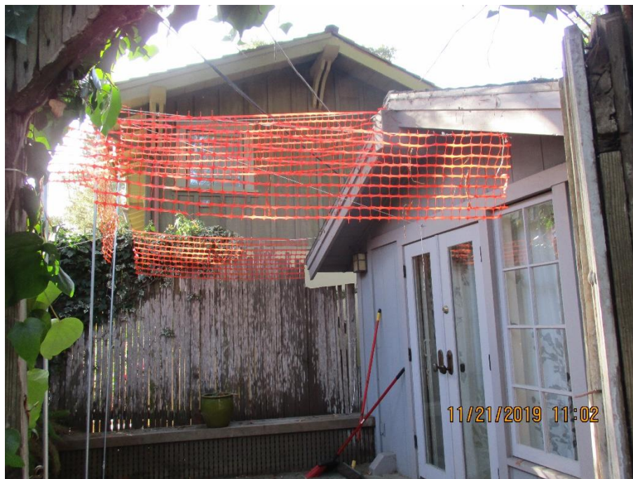
Staking and Flagging Showing Proposed Detached Garage