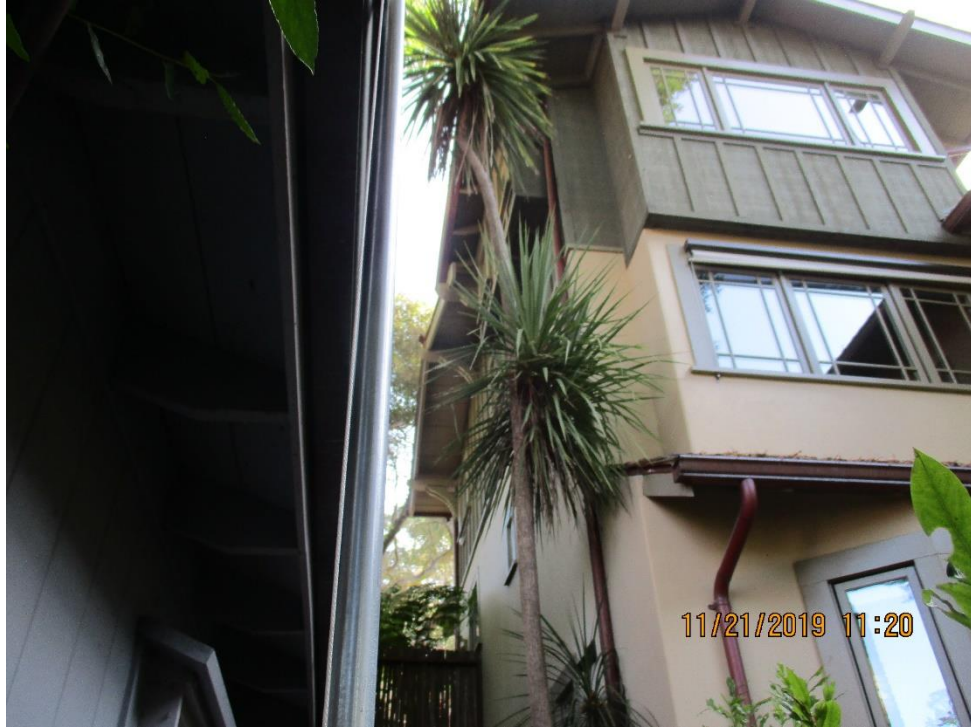
Neighboring 3-story residence to the south