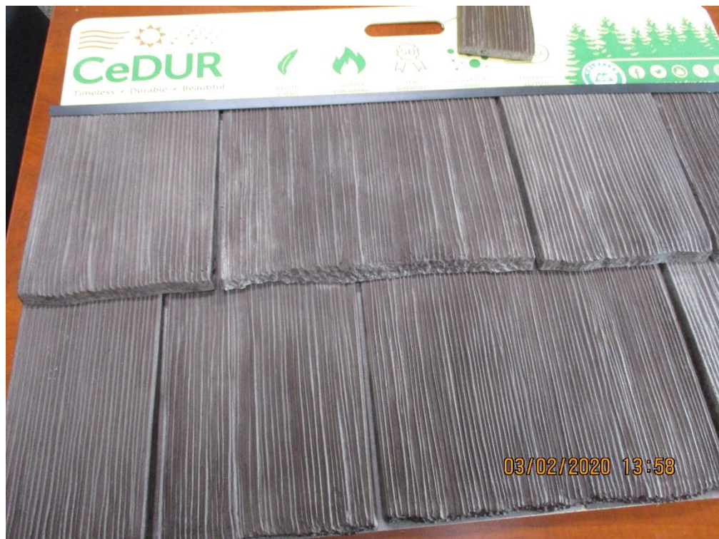
Proposed Synthetic Simulated Wood Shingle Roof