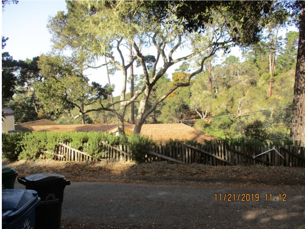
Residences located directly across 2 nd Avenue from the project site located down the hill