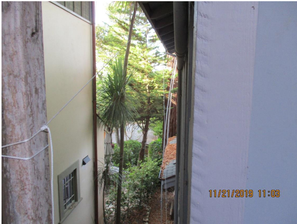
Neighboring 3-story residence to the south