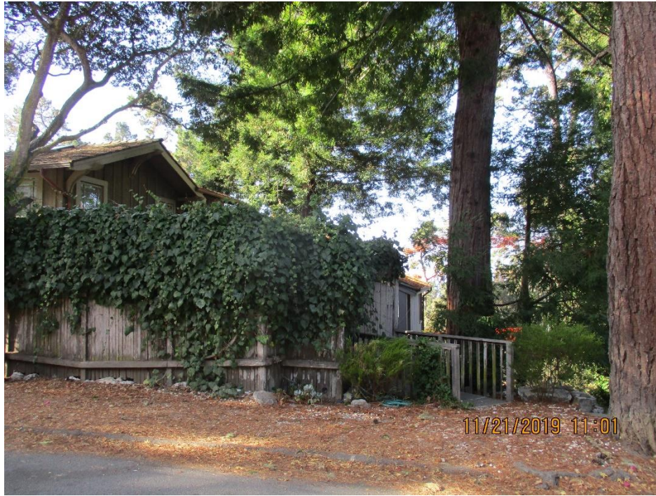
View of the Staking and Flagging from the Front East Elevation on Monte Verde Street