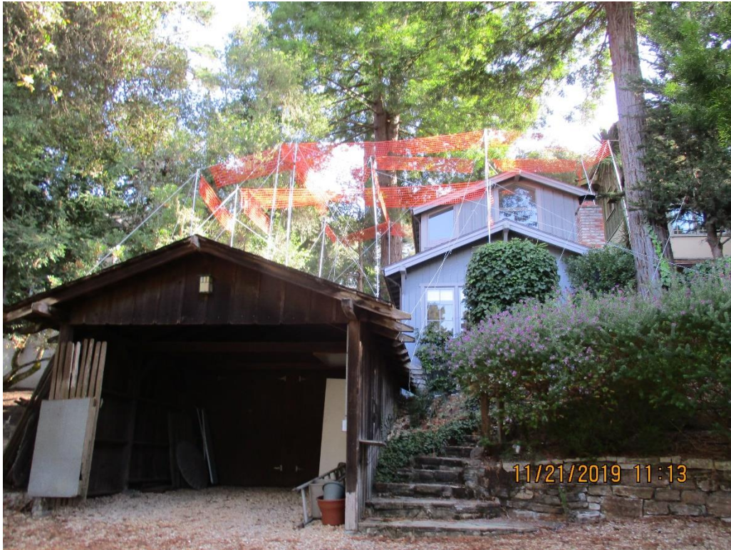
View of the staking and flagging from the 2 nd Avenue elevation of this double-frontage lot