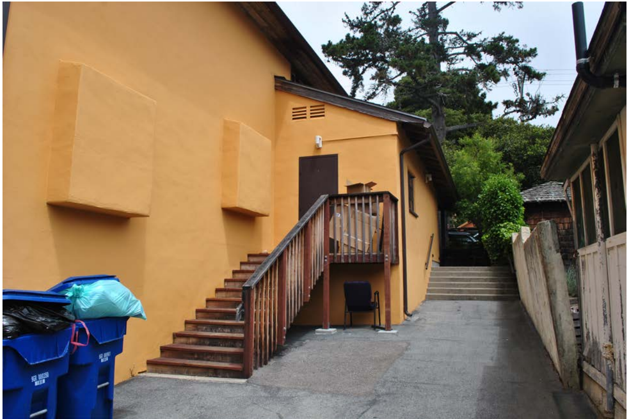
Figure 3. South Elevation (viewed looking east). A new landing and ramp extending from the southern end of the existing landing (as seen in figure 2) extending to the top of the concrete stairs on the right side of the photo. Wooden stairs and landing seen on the left side of the photo are proposed to remain.