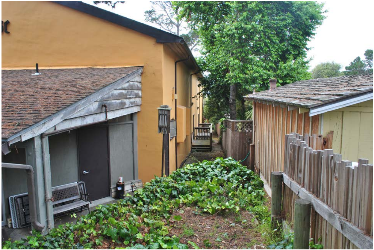
Figure 5a. North Elevation (viewed looking west). Existing landing and stairs proposed to be enclosed. Setback after proposed enclosure: 2 feet.