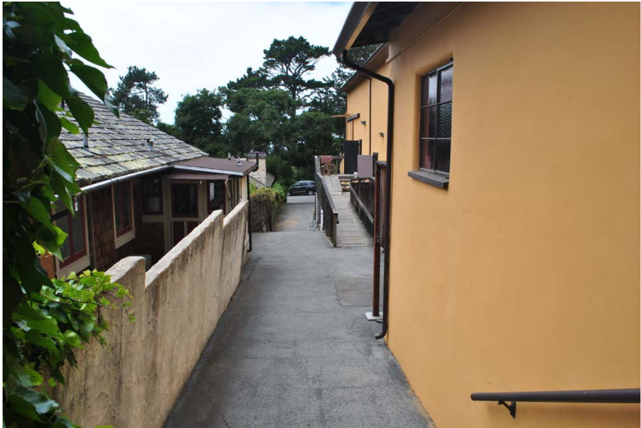
Figure 2. South Elevation (viewed looking west). Existing exit ramp is proposed to be enclosed with a new landing and ramp extending from the southern end of the existing landing toward the photographer's location.