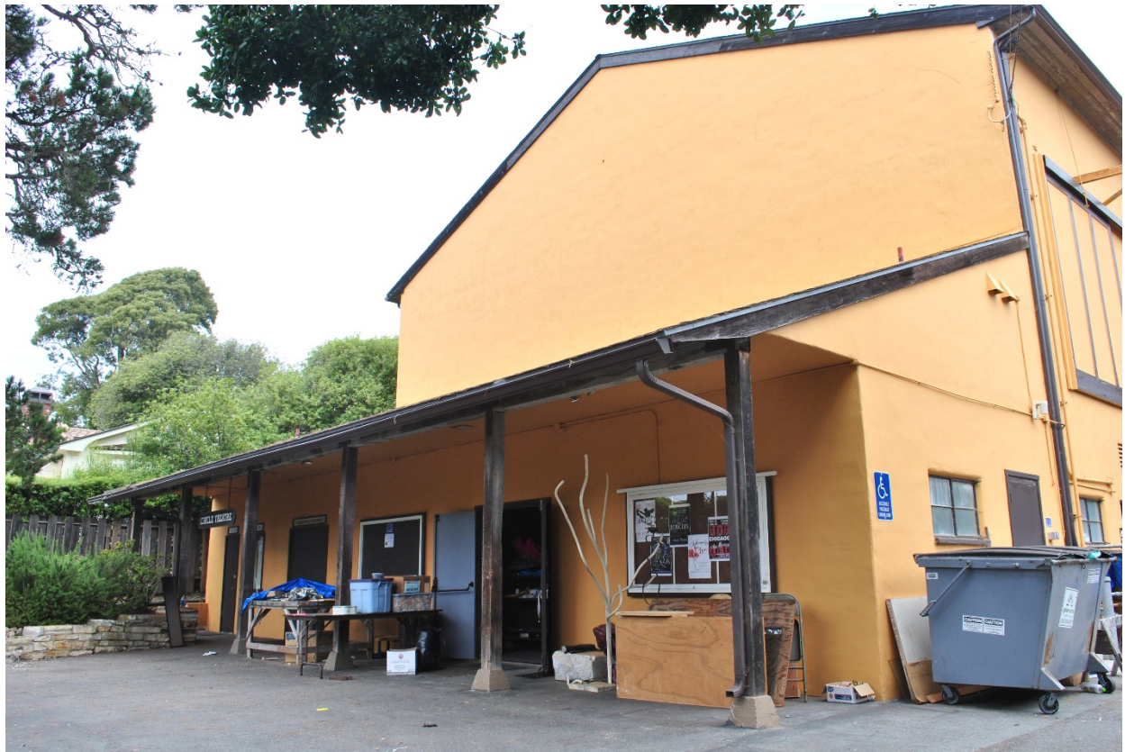
Figure 4. West Elevation. Area of new circle theater lobby addition (Phase 2A); prop shop addition proposed to be located above the existing shed roof (Phase 2B).