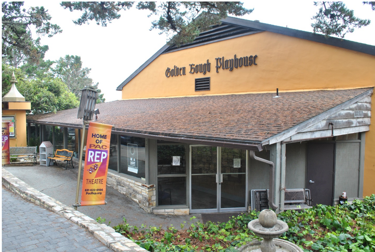
Figure 1. East Elevation from Monte Verde Street. Area of office addition proposed to be located above the existing lobby.