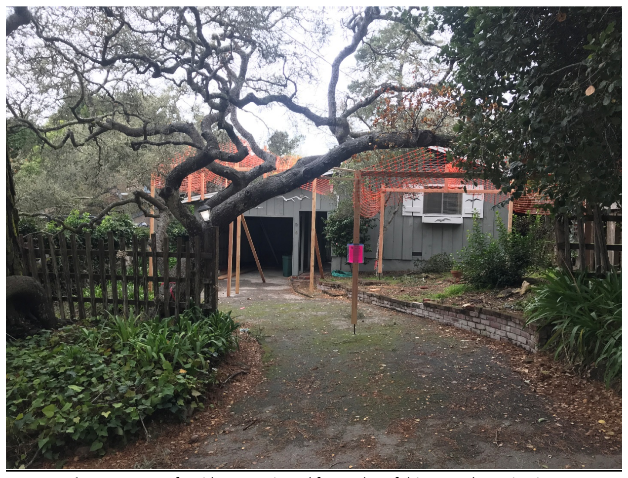
Figure 1: Front of residence as viewed from edge of driveway along Vizcaino.