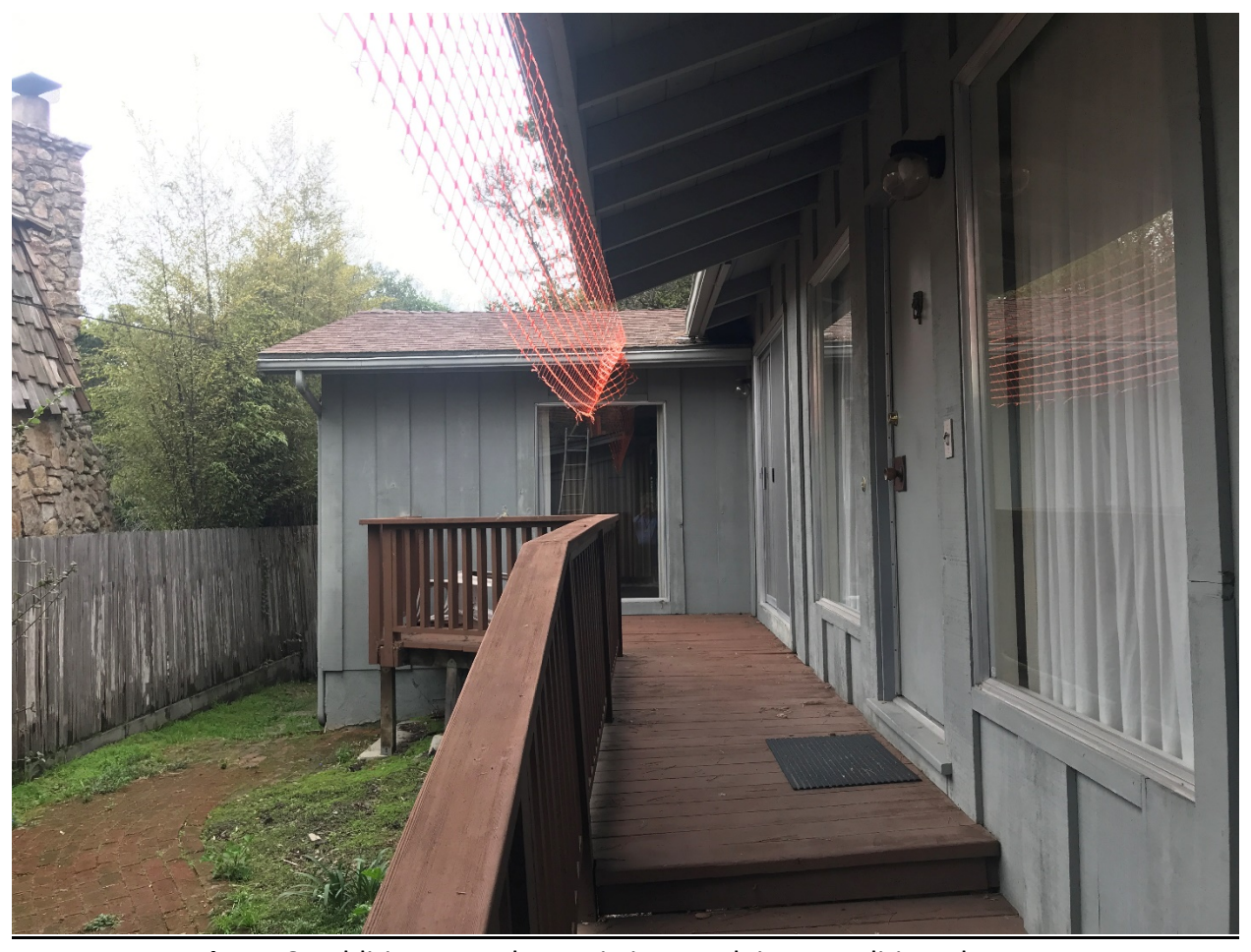
Figure 6: Addition to enclose existing porch into conditioned space.