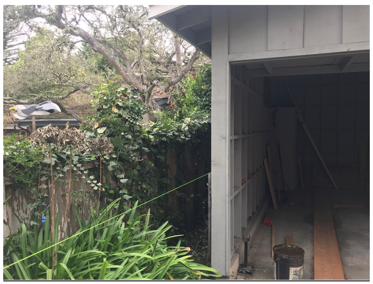
Figure 4: Non-conforming carport wall. The subject wall does not meet the composite setback requirements. The wall shall remain intact for the duration of construction, and any removal shall require the wall to be brought into a compliant location. The yellow/green string in the photo indicates the location of the 3' setback.