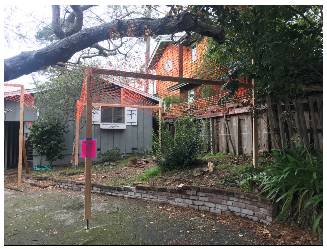
Figure 2: Story poles for detached garage. Tree in foreground proposed to be removed.