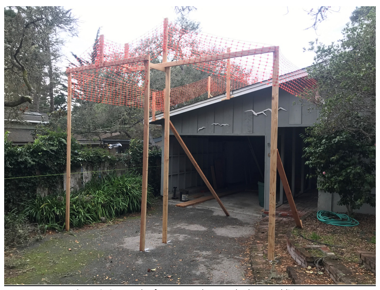
Figure 3: Story Poles for proposed master bedroom addition.