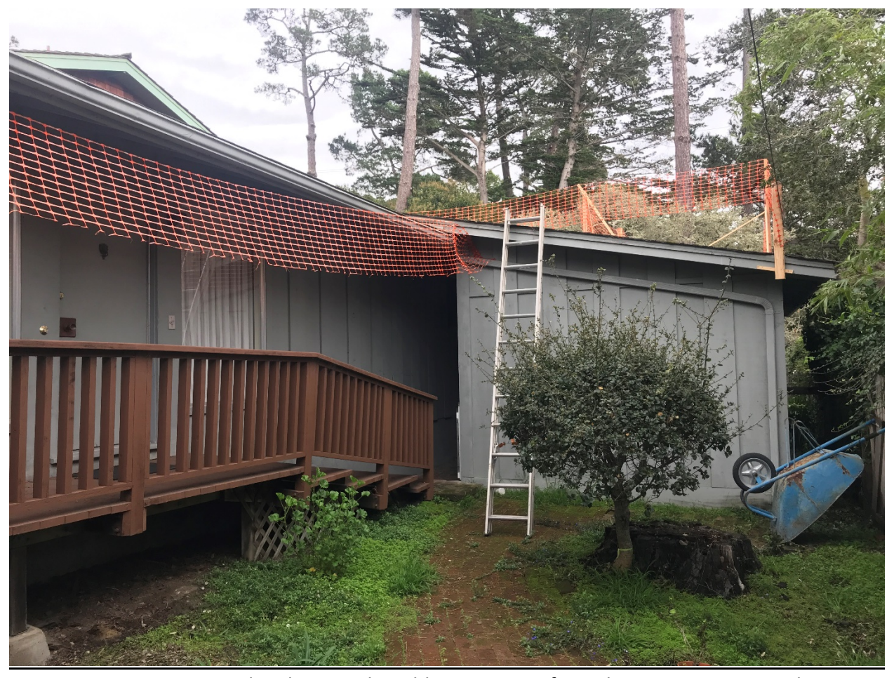
Figure 7: Story poles showing the addition as seen from the interior court yard.