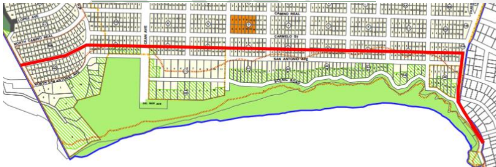
FIGURE 1. Coastal Access Parking Area [Map forthcoming]

7. Front Setback. Type 2 and Type 3 ADUs shall comply with the front yard setback requirements of the applicable zoning district including the front setback. New Type 3 ADUs may be established within the front yard setback when the analogous findings for locating a garage/carport established in CMC 17.10.030.A.1.a, are made in the affirmative through the appropriate review process, as applicable.