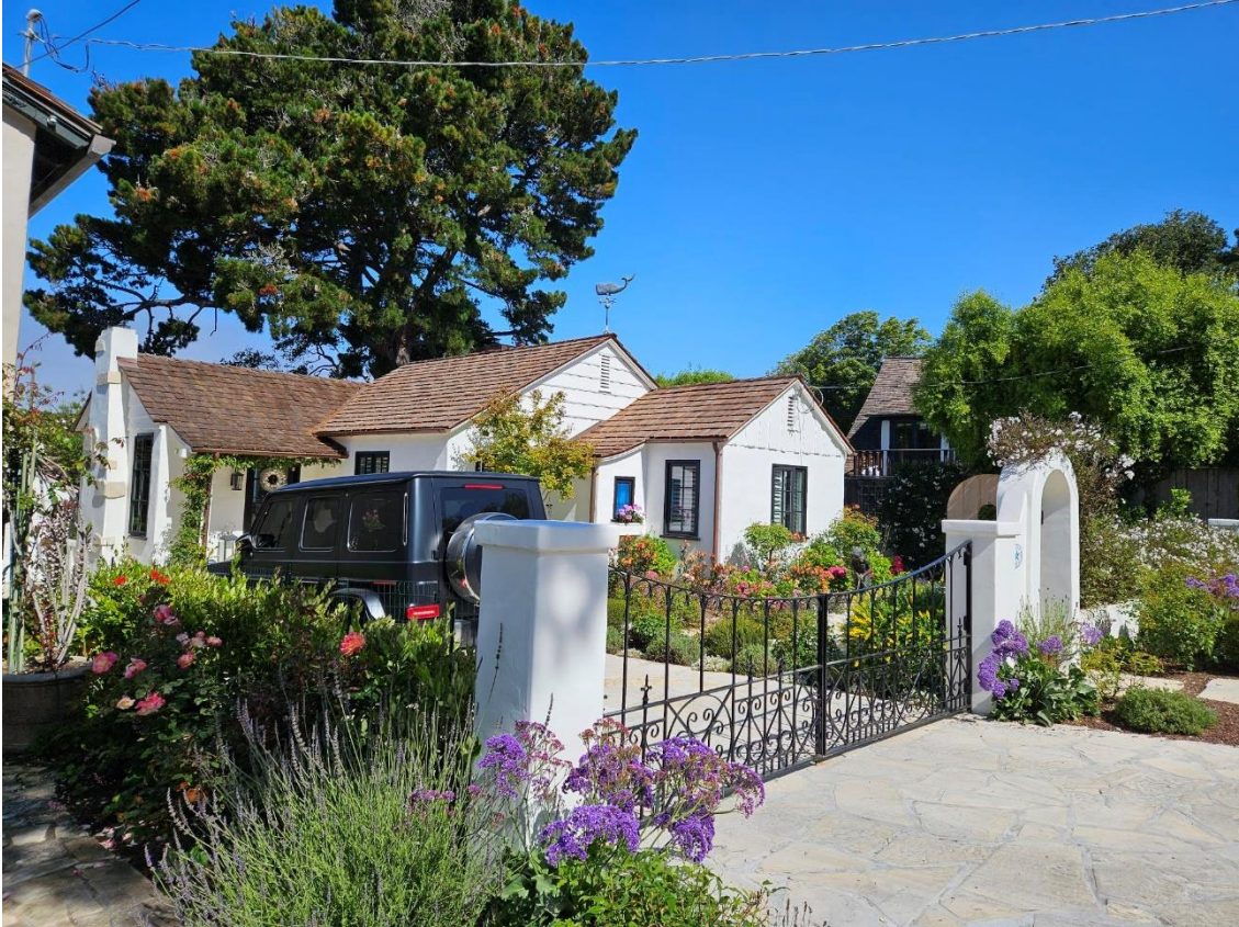
View looking northwest