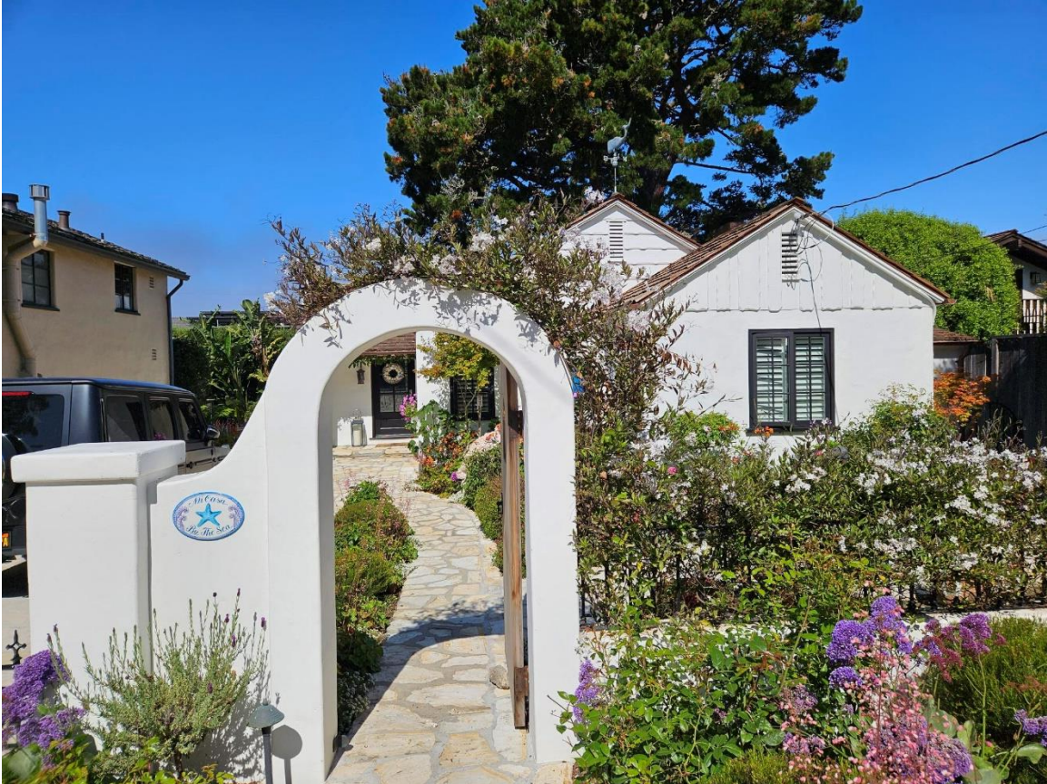
View of front gate