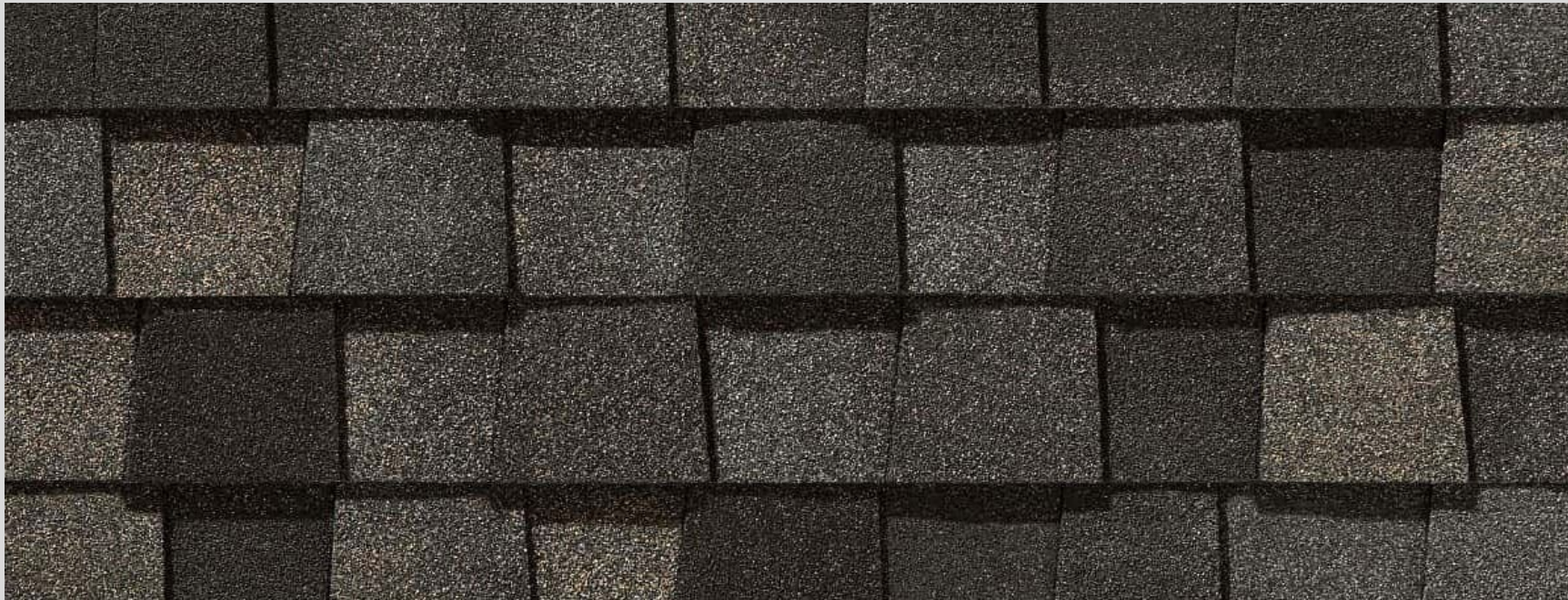
Photo of the Landmark TL shingles in Country Gray