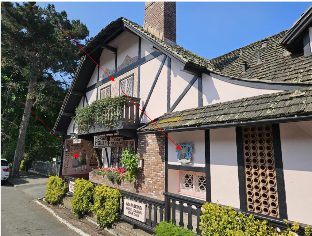
Figure 3: View of hotel's porte cochere with mural and family shield, looking southwest from San Carlos Street.