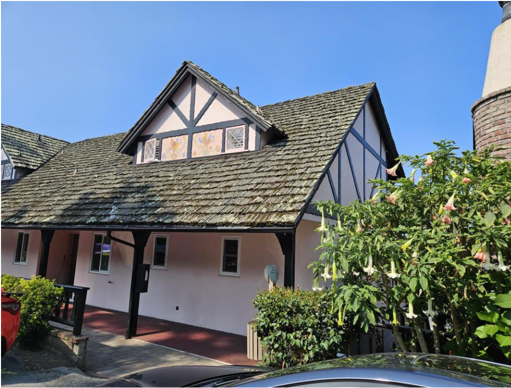
Figure 2: North wing looking southwest from San Carlos Street.