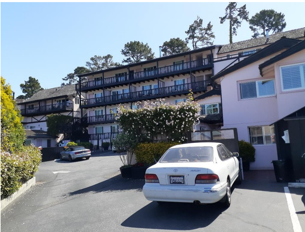
Figure 5: Rear elevation of 1957 hotel looking northeast.

For a property to be listed under Criterion Two (Important Person) it must be associated with a person who is considered significant within Carmel’s historic context. An individual must have made contributions or played a role that can be justified as significant and the contributions of the individual must be compared to others who were active, prosperous, or influential in the same sphere of interest. Carmel had over fifty hotels, inns, and motels that were in operation at the same time Donna Hofsas was managing the Hofsas House Hotel. There is no indication in the historical record that Mrs. Hofsas played an outstanding role within the tourism community when compared to her peers. Maxine Albro painted the murals on the exterior walls of the Hofsas House Hotel, but her life achievements would be better represented by her own home which was located on Santa Rita between Fourth and Fifth Avenues. The Hofsas House Hotel is not eligible for listing in the Carmel Inventory of Historic Resources under Criterion Two.