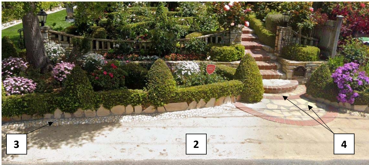
Existing right-of-way encroachments.