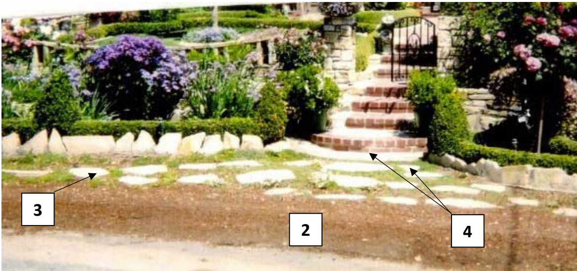
Previous (Undated) photograph of right-of-way.